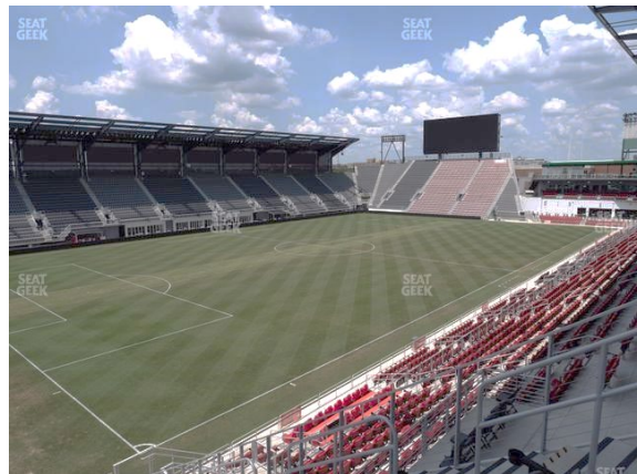
View of the field from Section 111

Join the FUN and FELLOWSHIP with members of the congregation, family and friends for an evening of Major League Soccer (MLS) as the D.C. United take on the Philadelphia Union in regular season play, bringing our church community together with groups from other area churches for a night of faith, fun, and fundraising for our parish!