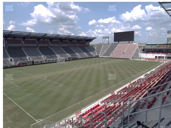
View of the field from Section 111

Join the FUN and FELLOWSHIP with members of the congregation, family and friends for an evening of Major League Soccer (MLS) as the D.C. United take on the Philadelphia Union in regular season play, bringing our church community together with groups from other area churches for a night of faith, fun, and fundraising for our parish!